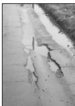
Station Road, Adisham