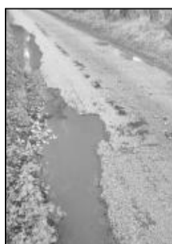
Rabbit Hole, Barham