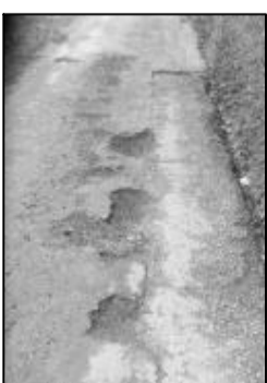
Covet Lane, Kingston