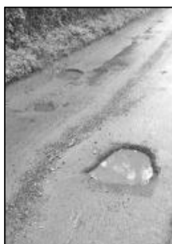
Covet Lane, Kingston