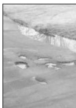
The Street, Adisham

An embarrassing collection of potholes in the area.