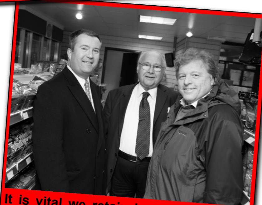
It is vital we retain local shops, post offices and other services. Working for this would be a better use of the money being wasted on Kent TV!