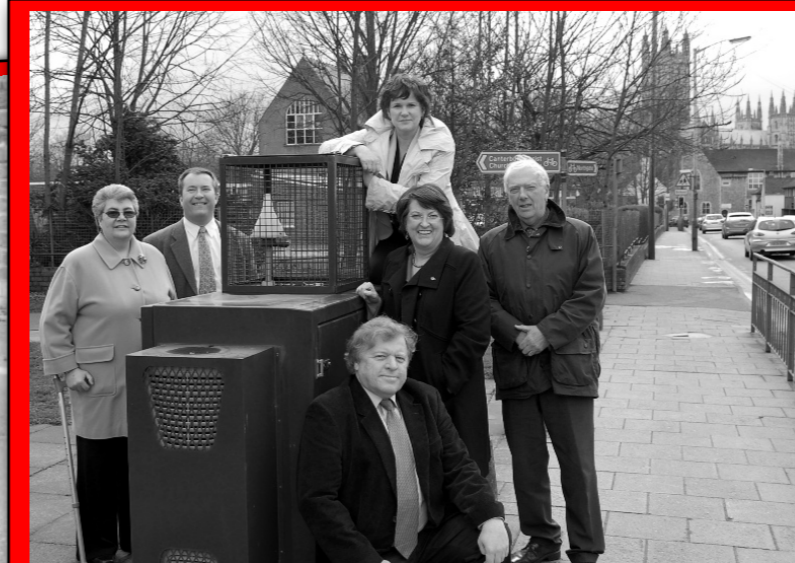
KCC Liberal Democrats have pursued a "green" agenda for many years. We alone opposed the giant incinerator at Allington.