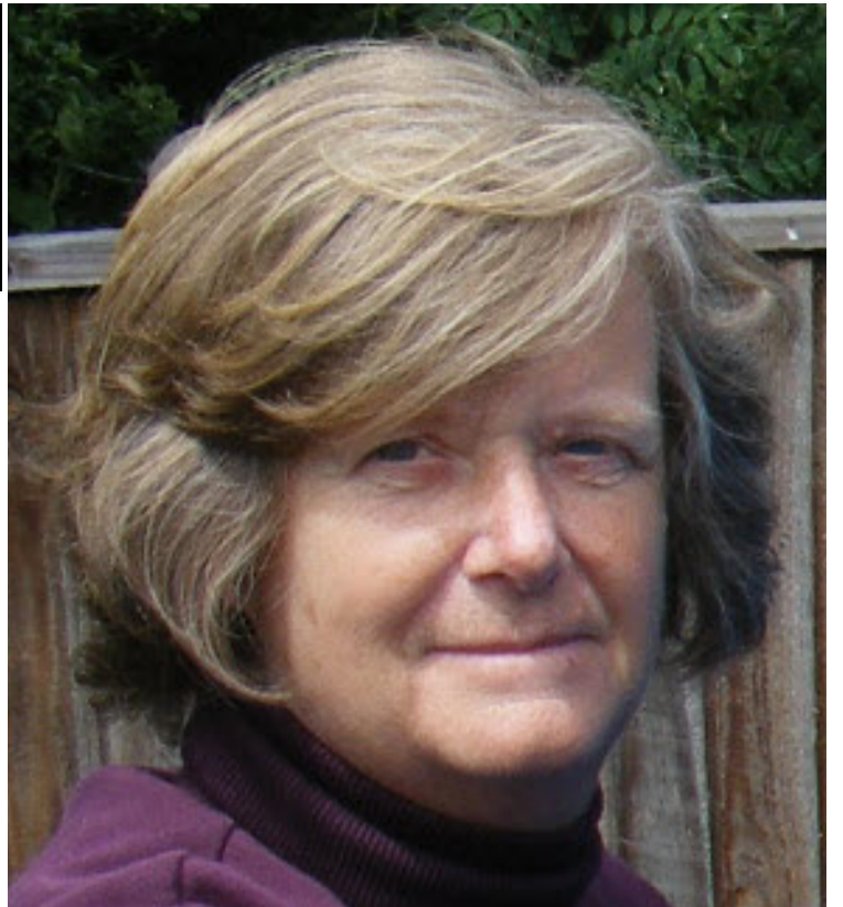
To view Headline in colour go to Trudy's page on kentlibdems.org.uk

The other election is for the South-East England Members of the European Parliament .