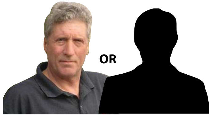
STREET POLITICIAN MISSING POLITICIAN

LOCAL MAN for LOCAL POLITICS . Unlike the present County Councillor who lives in LAMBERHURST .